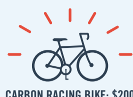
CARBON RACING BIKE: $200

Here are several red flags to watch out for when looking at ads online: